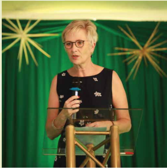
Her Excellency Caroline Vicini Ambassador, Embassy of Sweden in Kenya

Today, human rights are under increasing pressure in many parts of the world and it is therefore important to come together and remind each other that positive changes are taking place.