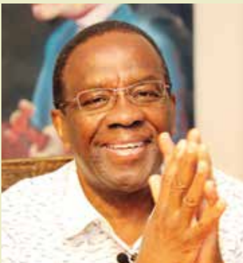
DR. WILLY MUTUNGA Jury Panel Member